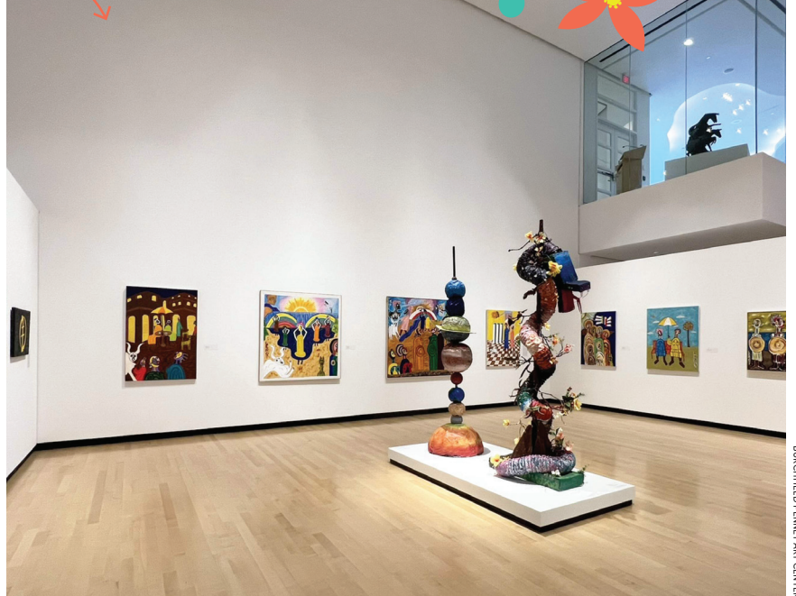
BURCHFIELD PENNEY ART CENTER